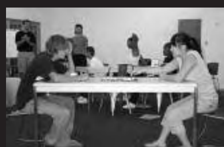
Teen Work! training program participants.